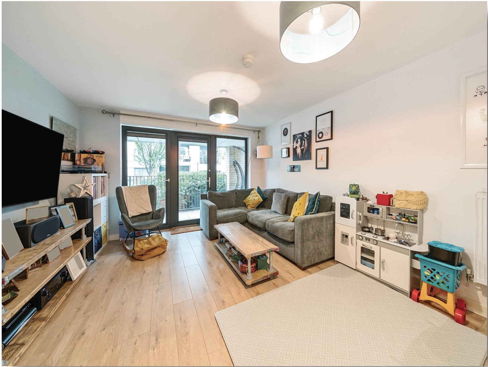
Akerman Road, London SW9