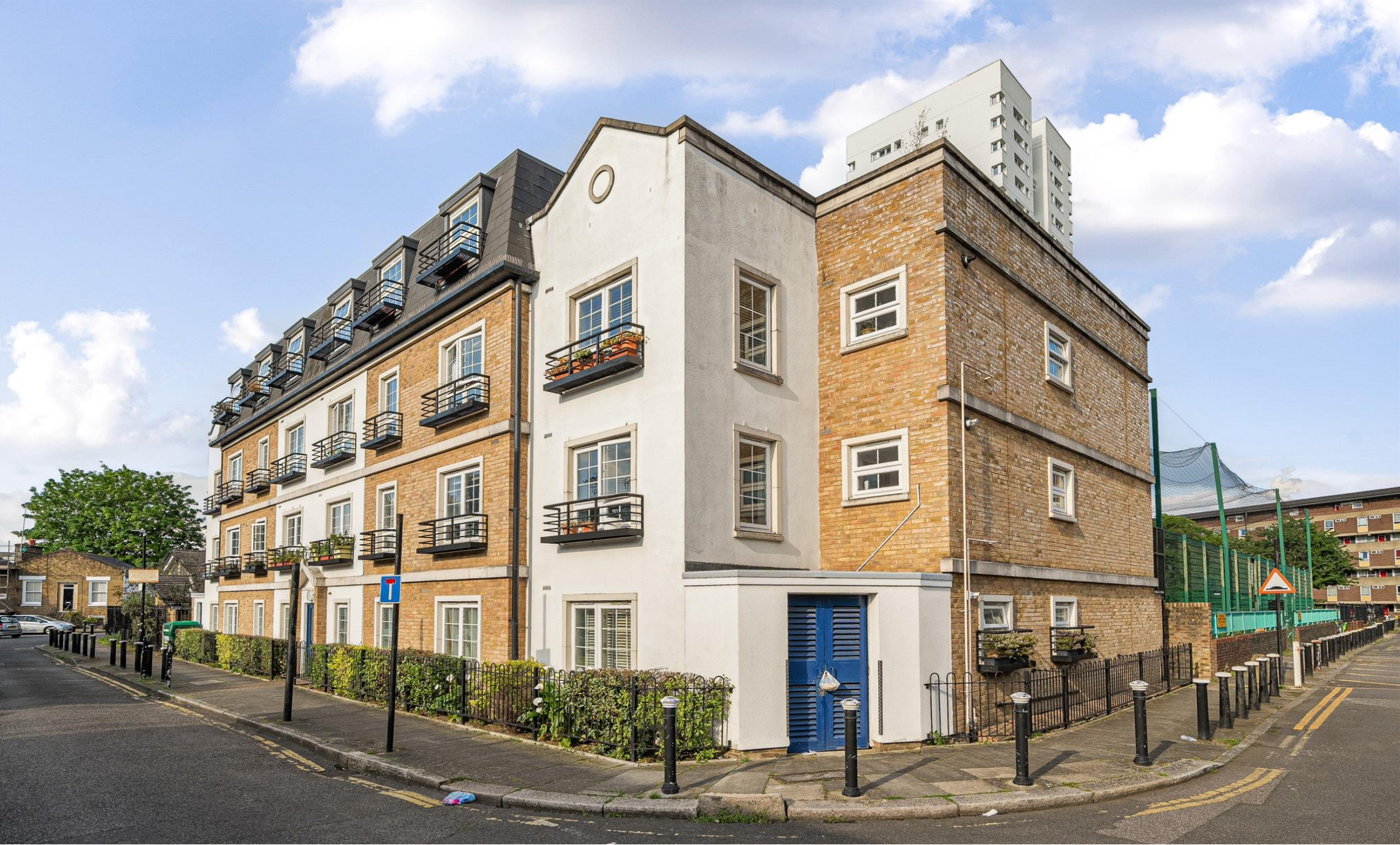
Portland Grove, London SW8