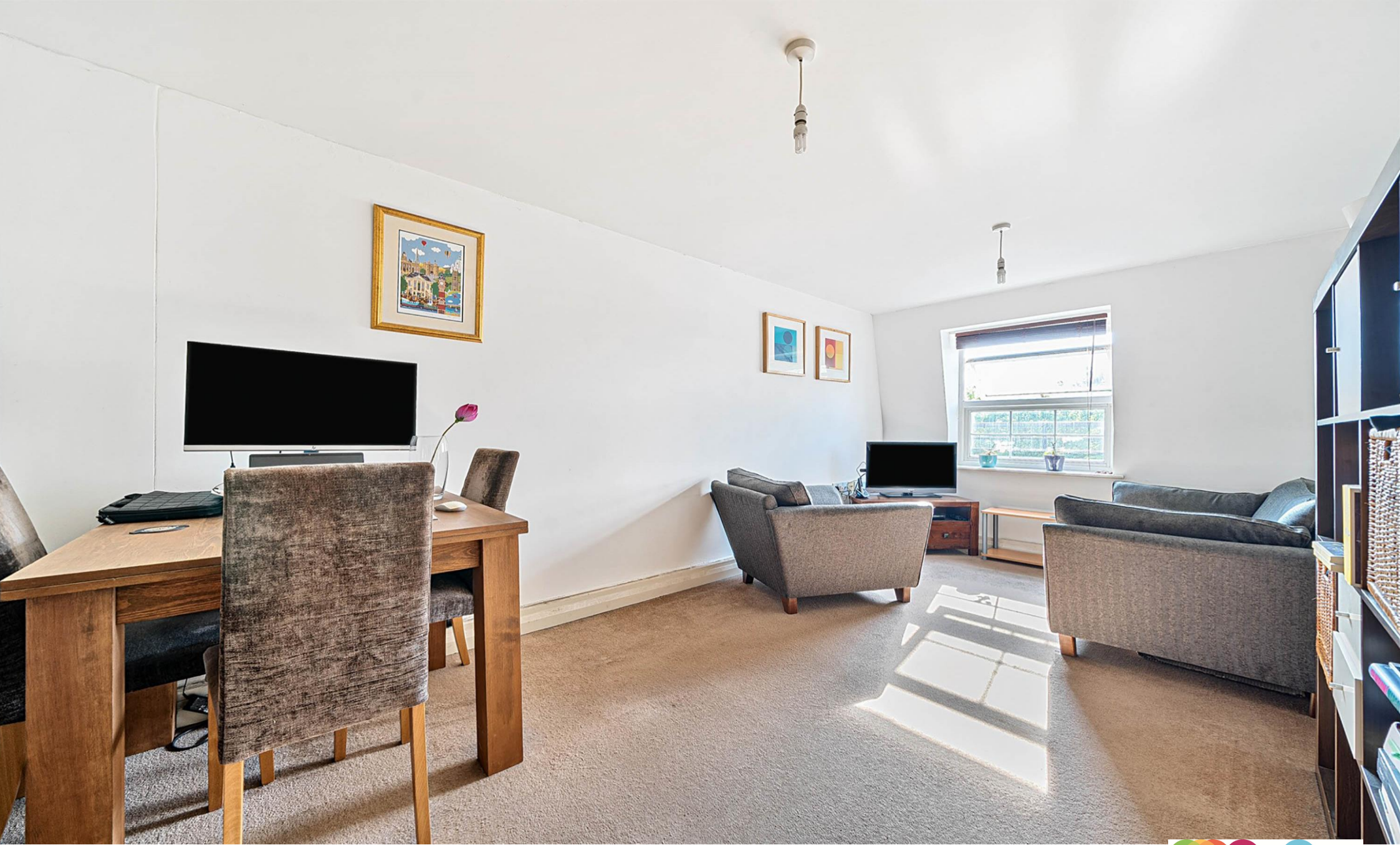
Portland Grove, London SW8