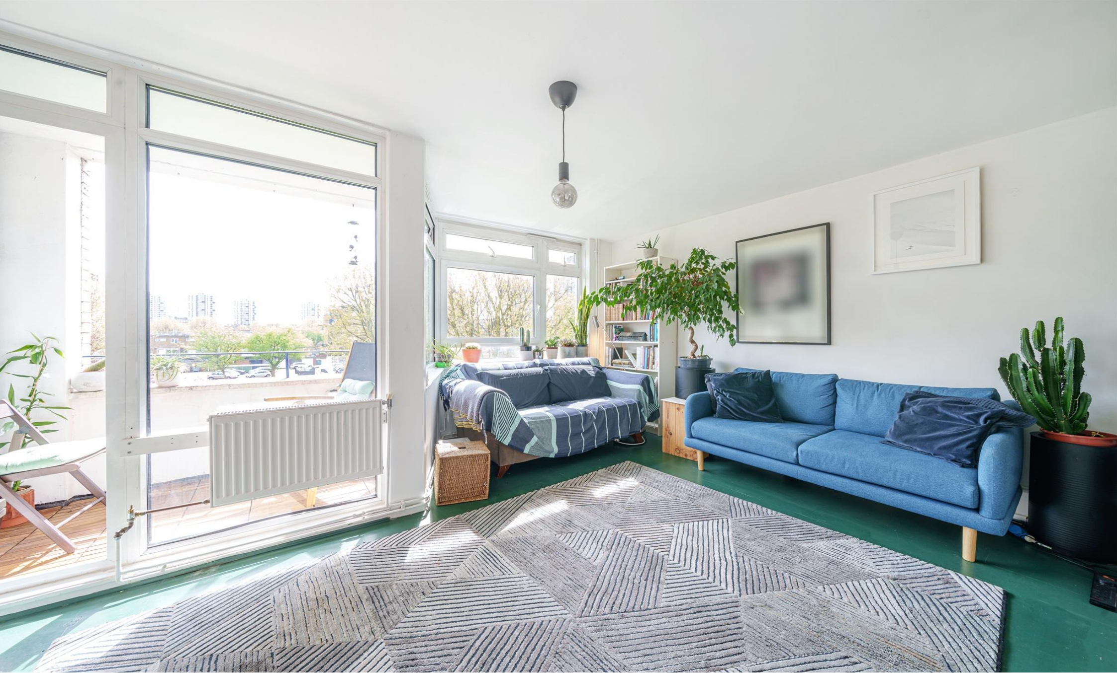
Morton House Brandon Estate, London SE17