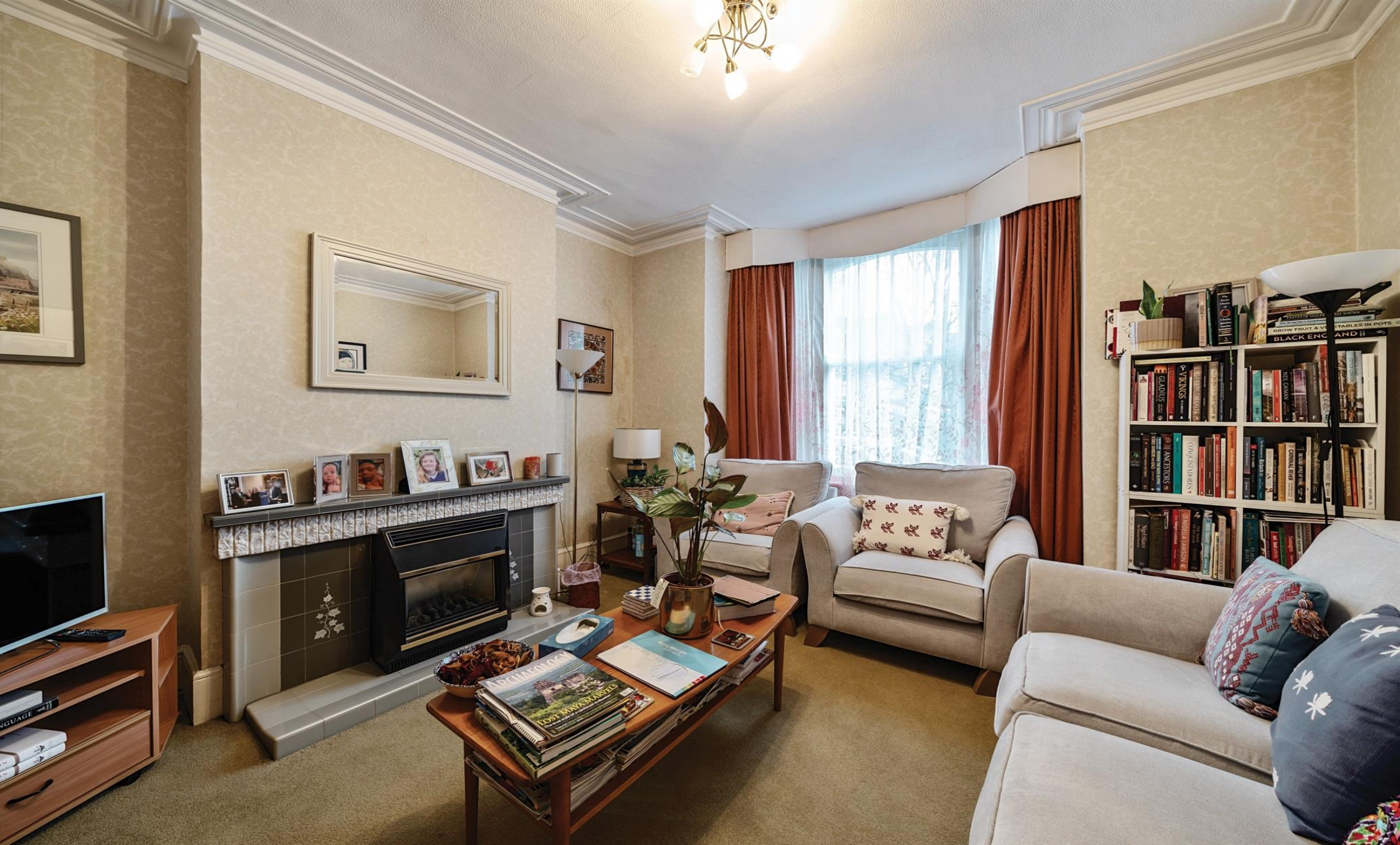
Penton Place, London SE17