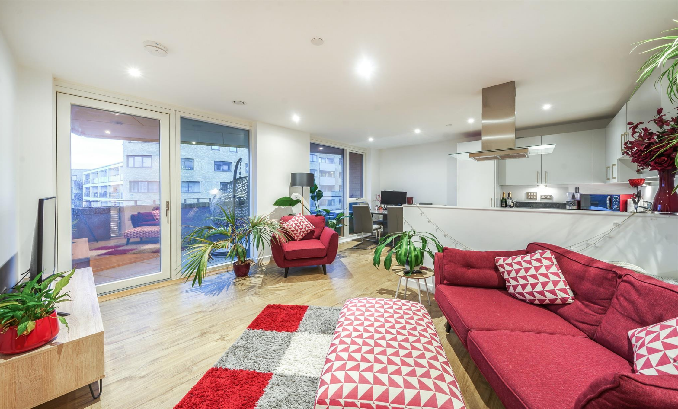
Angel Lane, London SE17