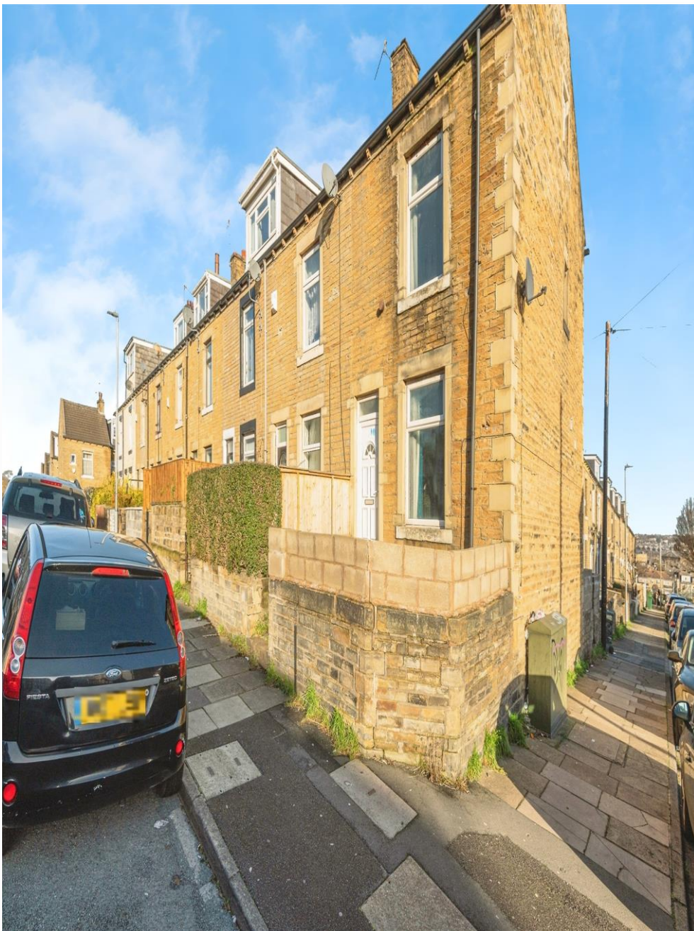
Aberdeen Place, Bradford BD7 2HG