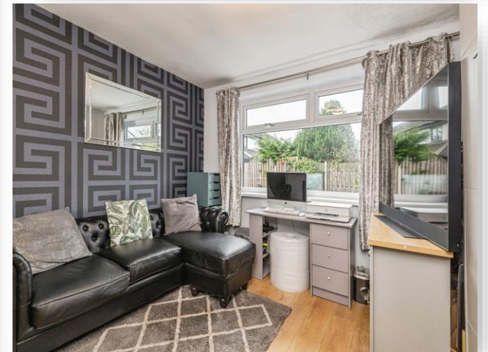
Tyersal Close, BRADFORD BD4 8HE