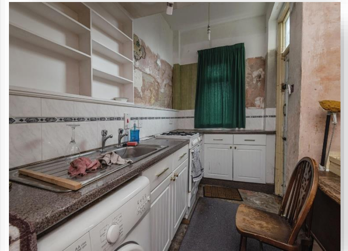
Hollingwood Lane, Bradford BD7 4DB