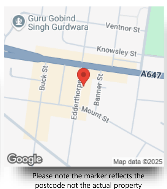
view this property online williamhbrown.co.uk/Property/BDF115826