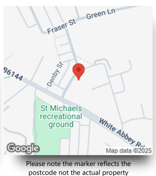
view this property online williamhbrown.co.uk/Property/BDF115704