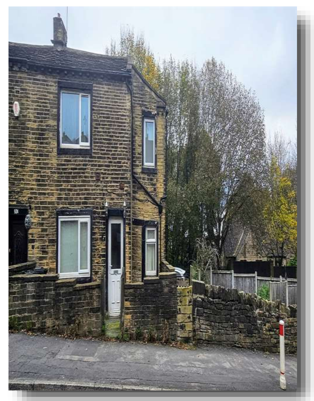
Great Horton Road, Bradford BD7 4AE