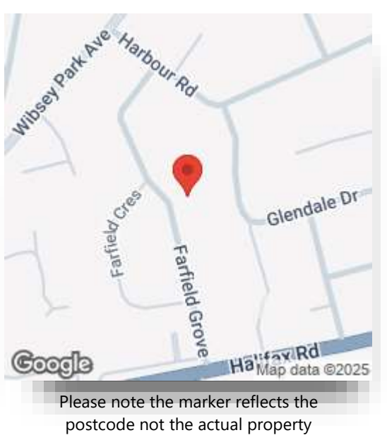
view this property online williamhbrown.co.uk/Property/BDF115418