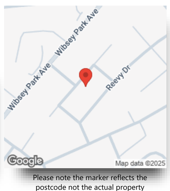
view this property online williamhbrown.co.uk/Property/BDF114928