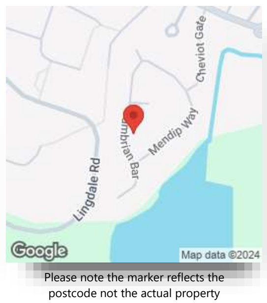
view this property online williamhbrown.co.uk/Property/BDF115142