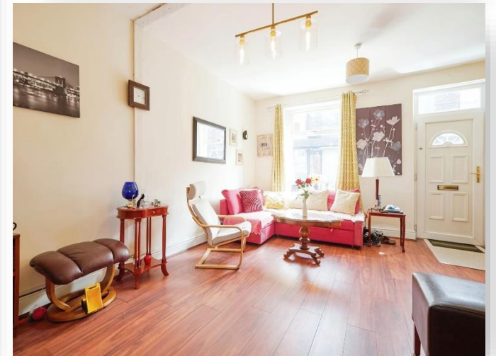
Burnett Place, Bradford BD5 9LX