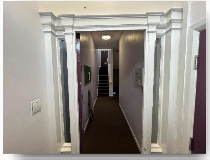
Flat 1-3 Ashgrove, Bradford BD7 1BN