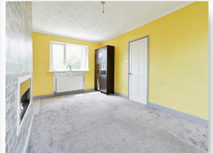
Belmont Avenue, Low Moor Bradford BD12 0PA