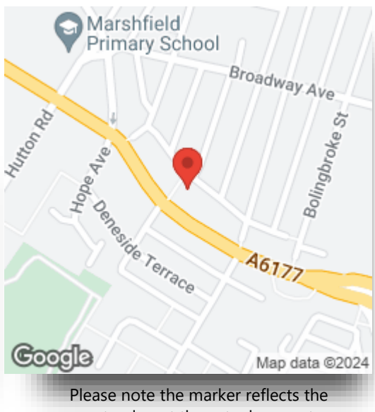
postcode not the actual property