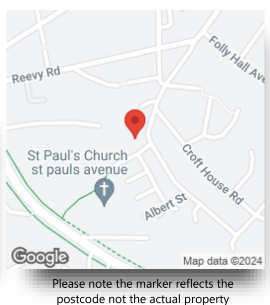
view this property online williamhbrown.co.uk/Property/BDF114517