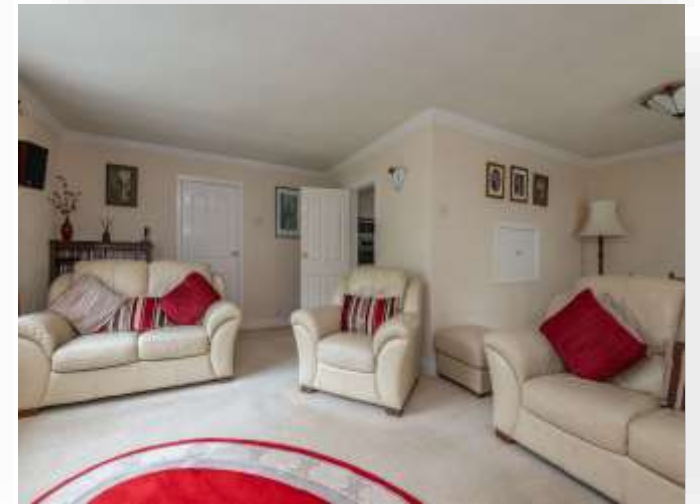
Brownroyd Hill Road, Bradford BD6 1RZ