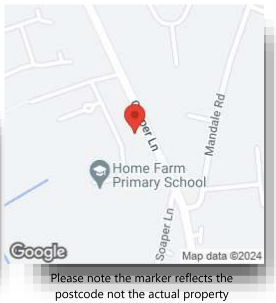
view this property online williamhbrown.co.uk/Property/BDF114658