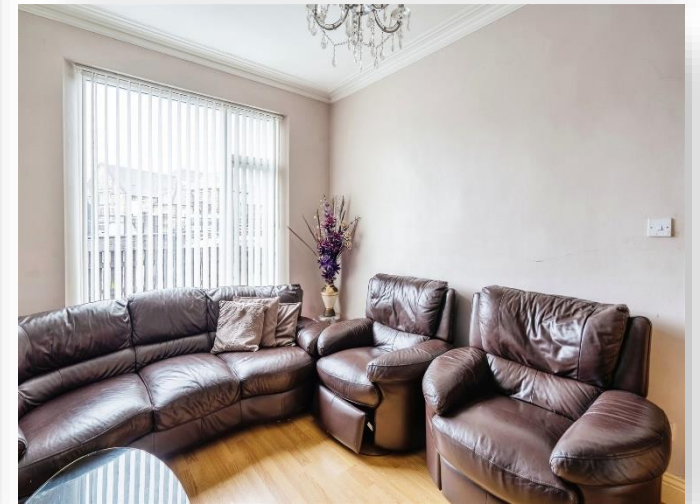
Thornton Lane, Bradford BD5 9DN