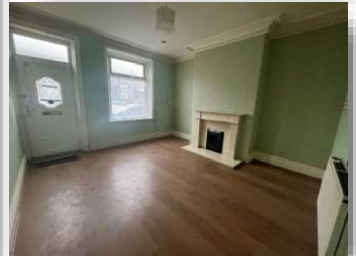
Hartington Terrace, Bradford BD7 2HJ