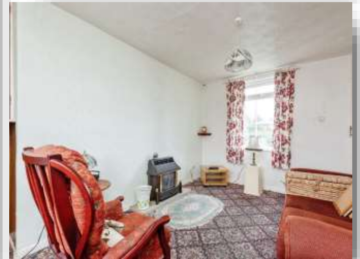
Smith Avenue, Bradford BD6 1HD