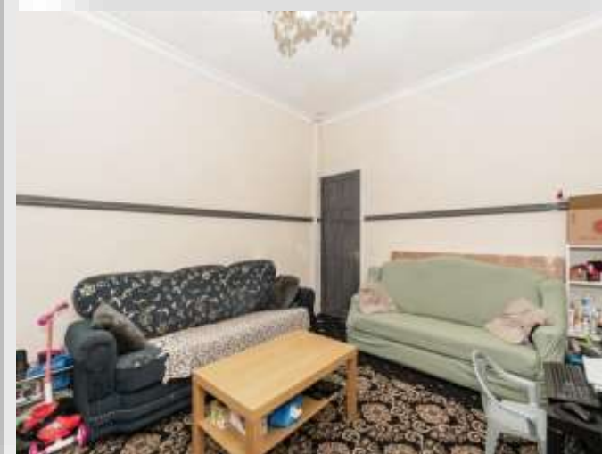
Aberdeen Place, Bradford BD7 2HQ