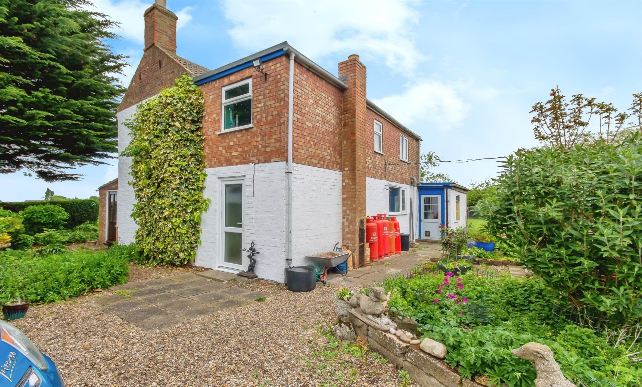
Ivy House Green Lane, New York Lincoln LN4 4XP