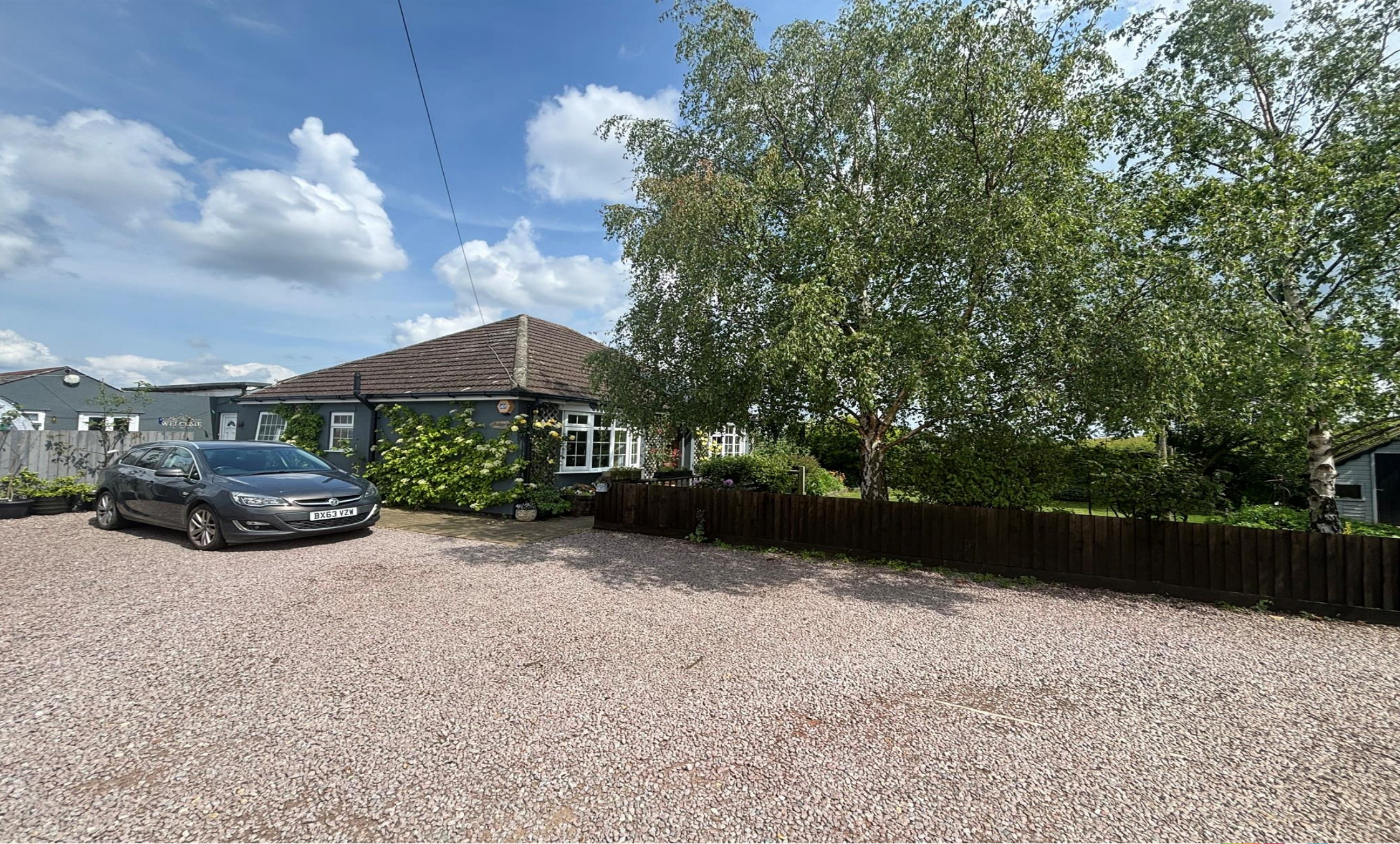
Walnut Cottage Boardsides, Hubberts Bridge Boston PE20 3QP