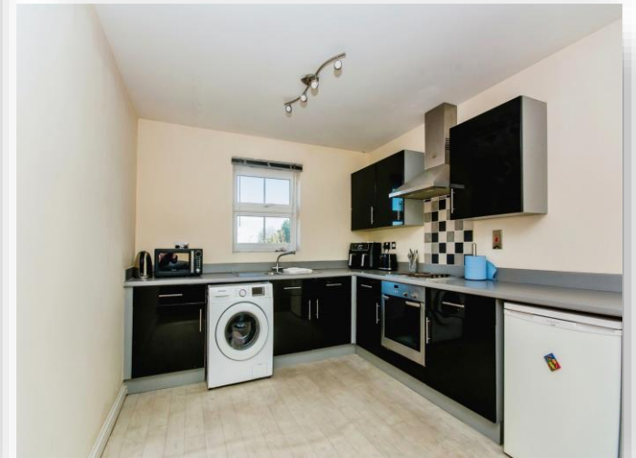
Jessop Court, Kirton Boston PE20 1AN