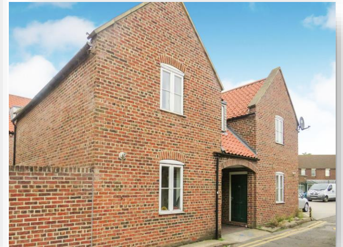
Properties At Sibsey Lane, Boston PE21 6HB