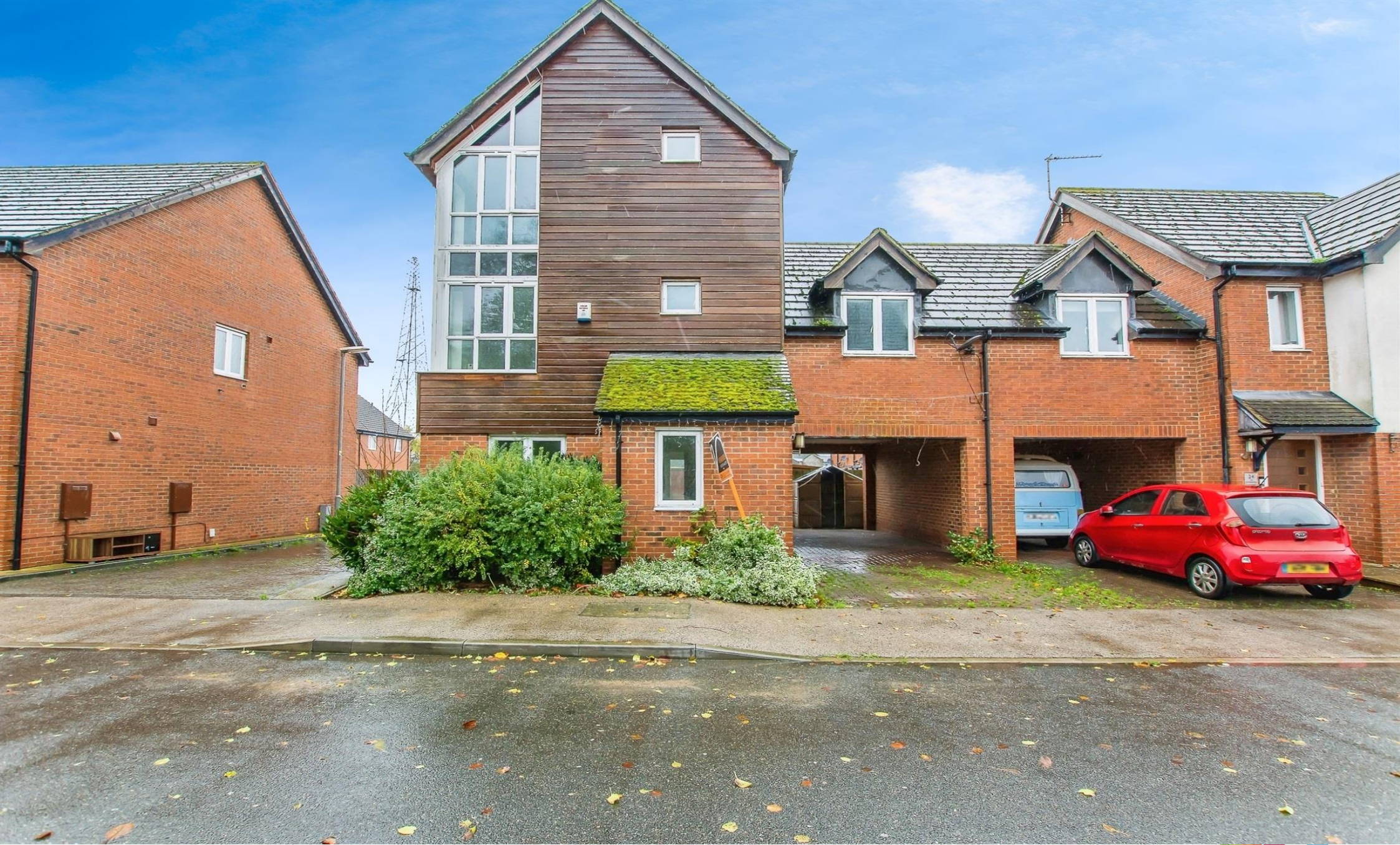
The Featherworks, Boston PE21 0AF