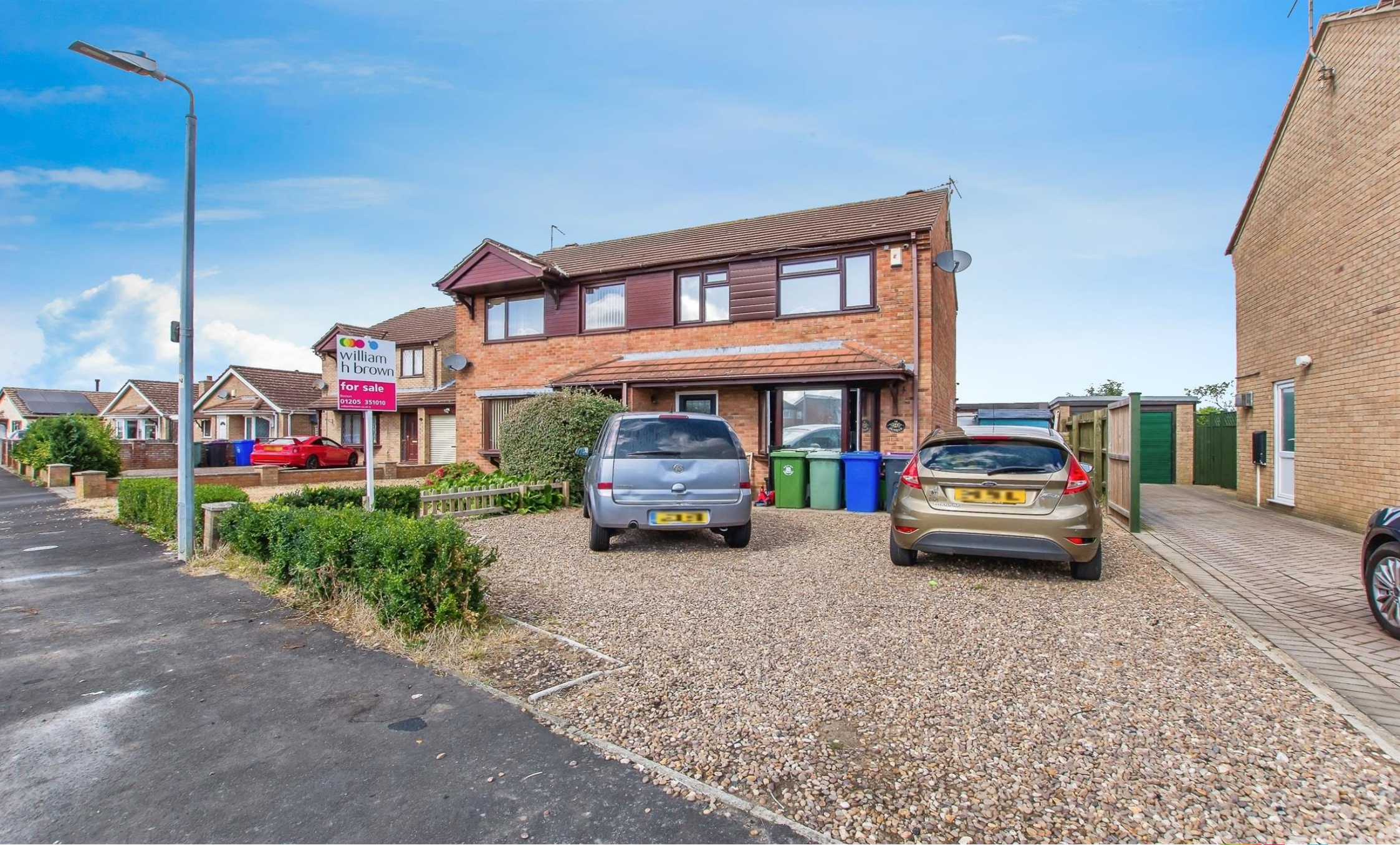
The Graylings, BOSTON PE21 8EB