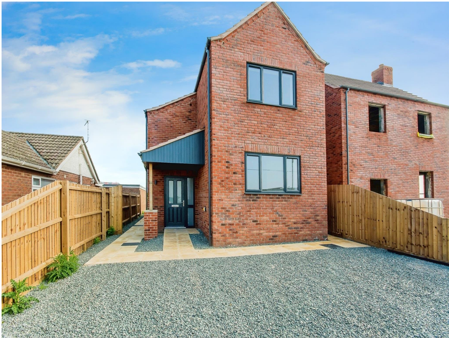
Plot 1 Watery Lane, Butterwick Boston PE22 0HS