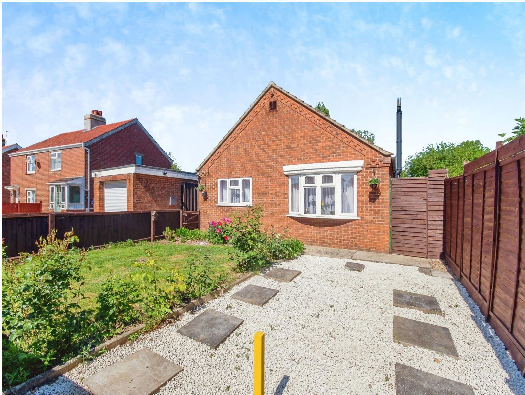
Bell Lane, Fosdyke Boston PE20 2BS