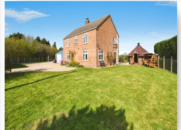
The Cottage Westville, Frithville Boston PE22 7HR