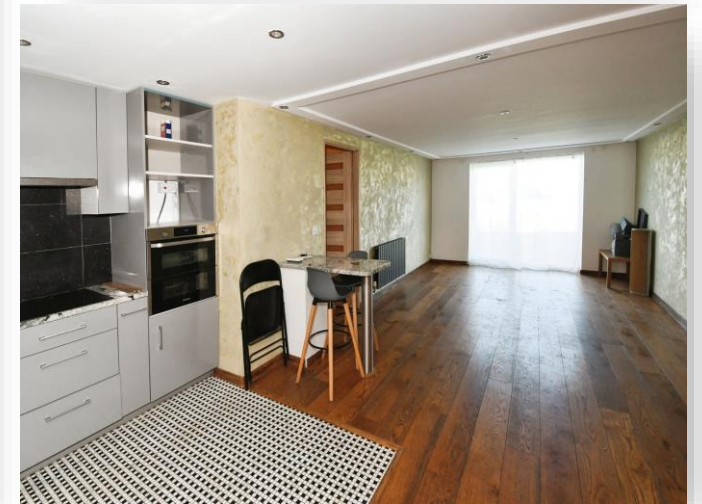
Carver Road, Boston PE21 8BH