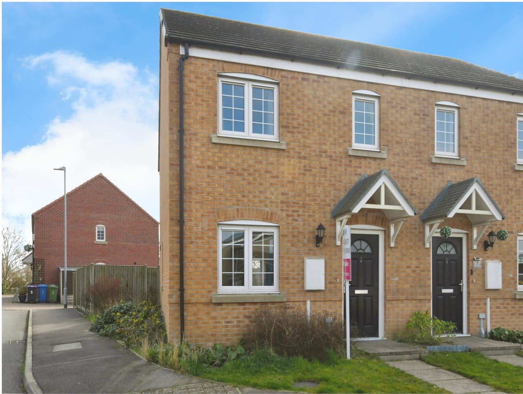
Mayflower Gardens, Old Leake Boston PE22 9NW