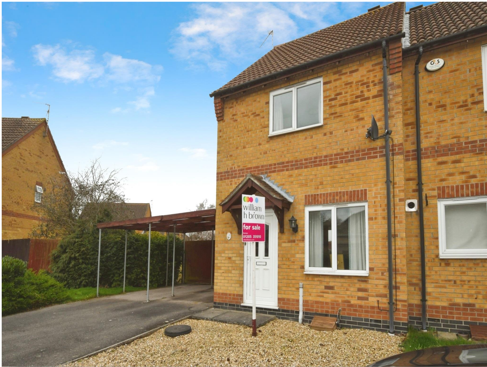
Taylor Close, Fishtoft Boston PE21 0NL