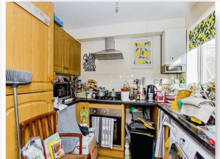
Larkspur Croft, Boston PE21 8EF