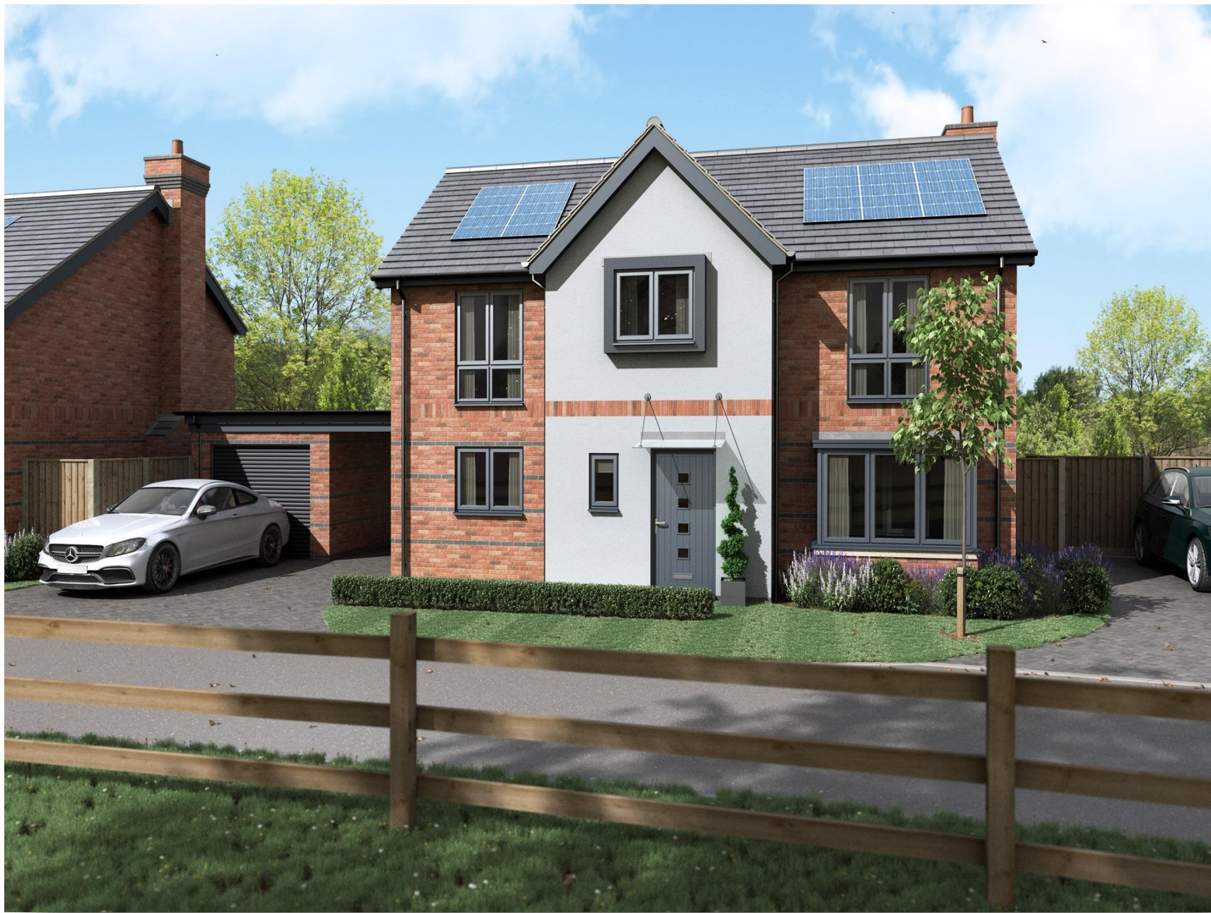
Pinder Gate Kirton Holme Road, Kirton End Boston PE20 1PB