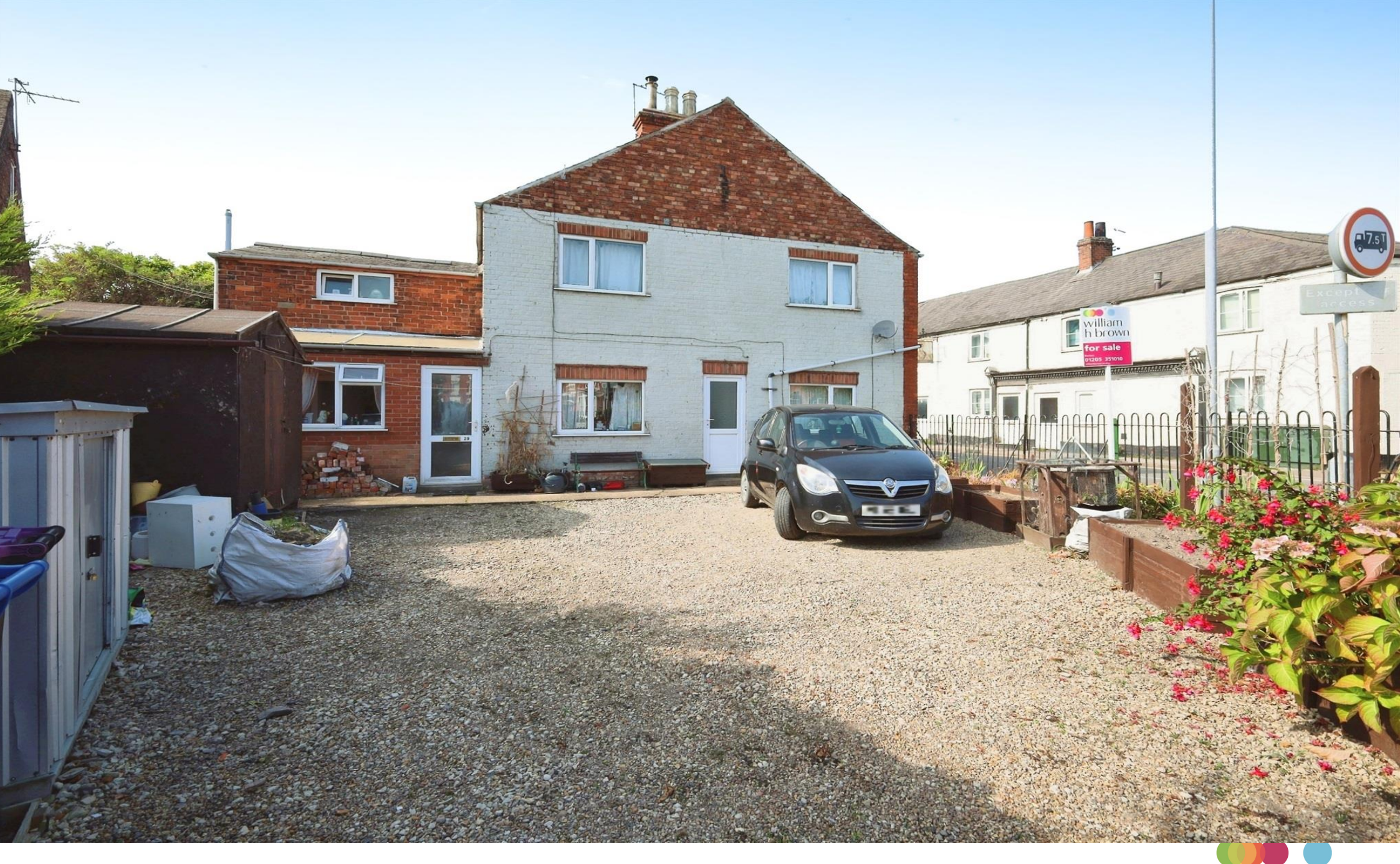
Vauxhall Road, BOSTON PE21 0JB