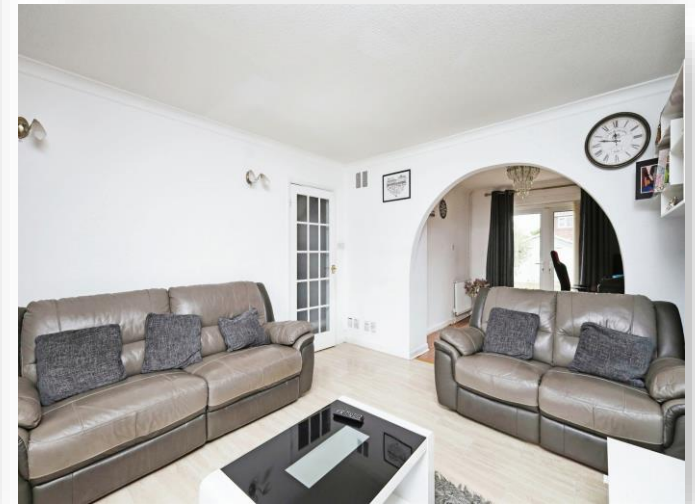
Burleigh Gardens, Boston PE21 9DE