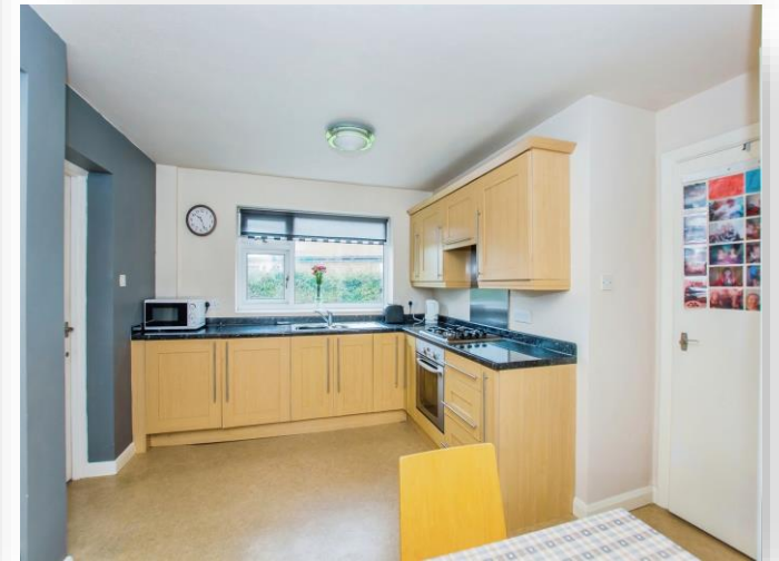
Glen Drive, Boston PE21 7QB