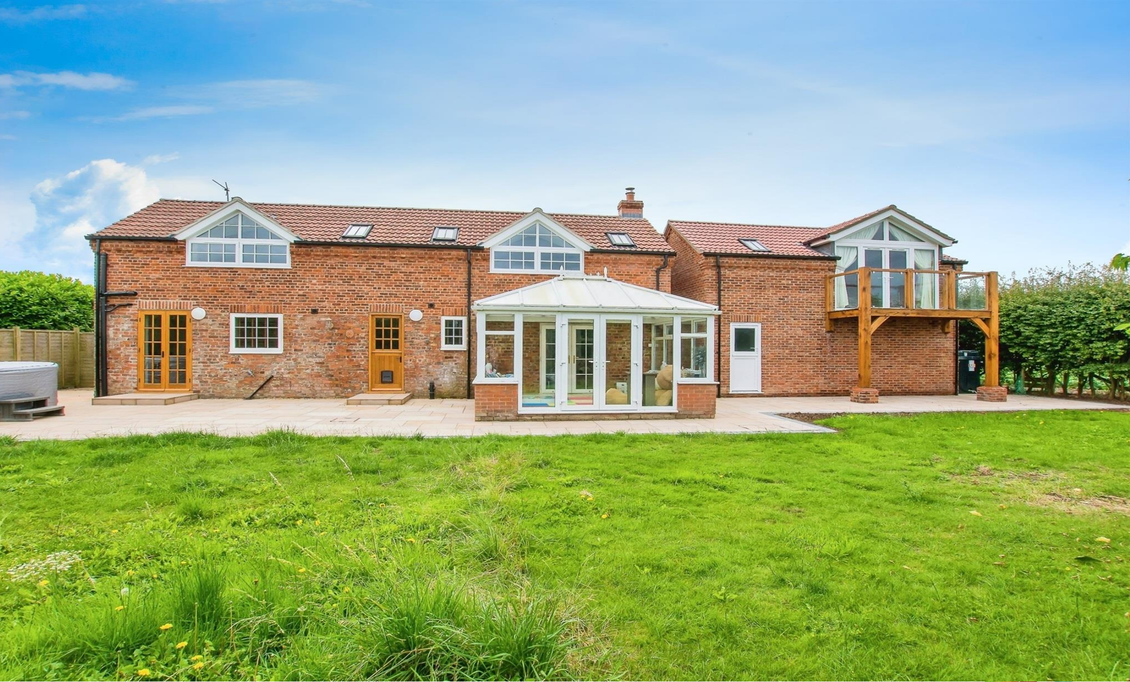
Lings Barn Grovefield Lane, Freiston BOSTON PE22 0QL