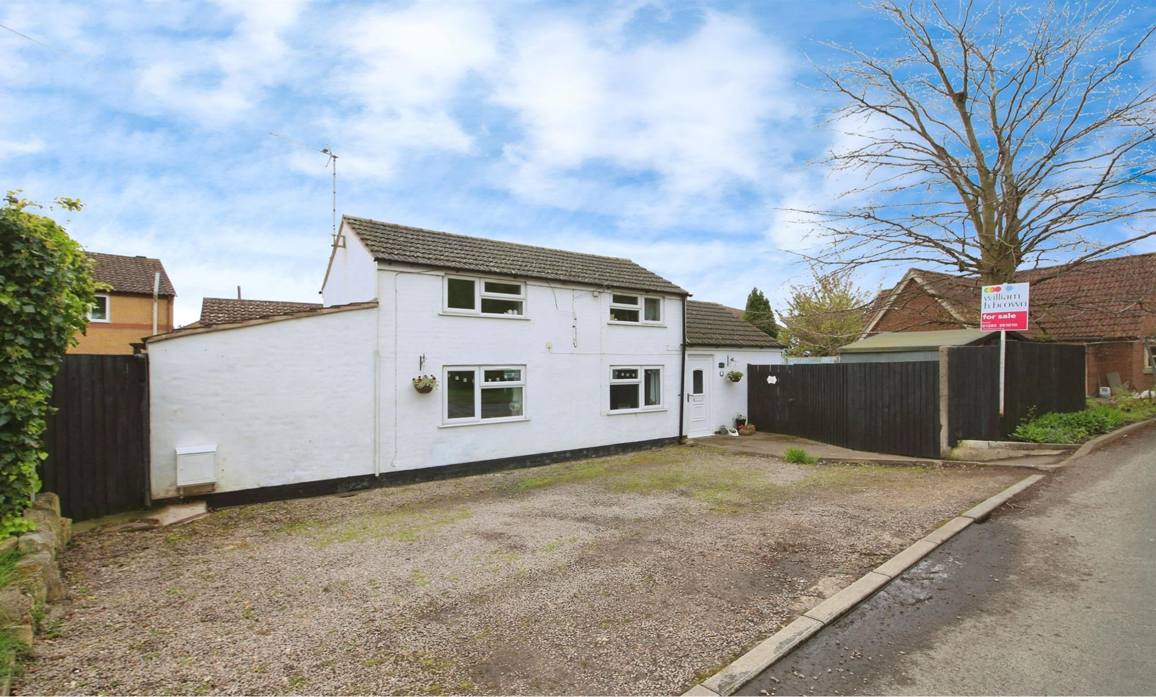
The Cottage Tattershall Road, Boston PE21 9LR