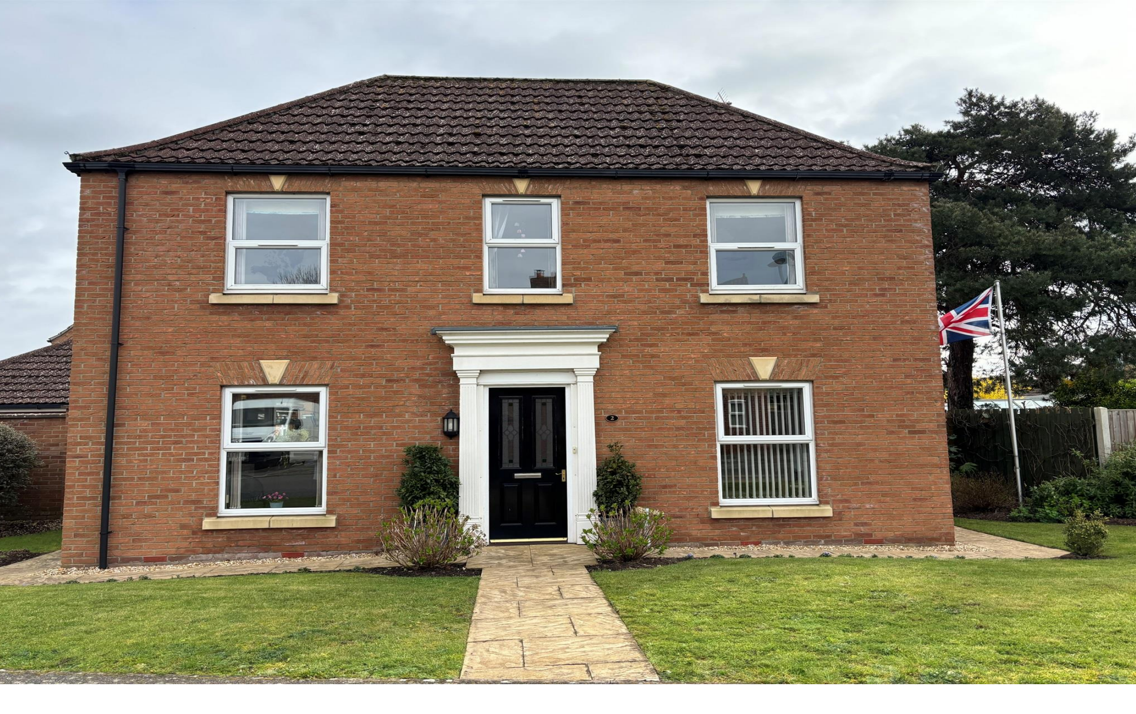
Grange Drive, Tattershall Lincoln LN4 4GJ