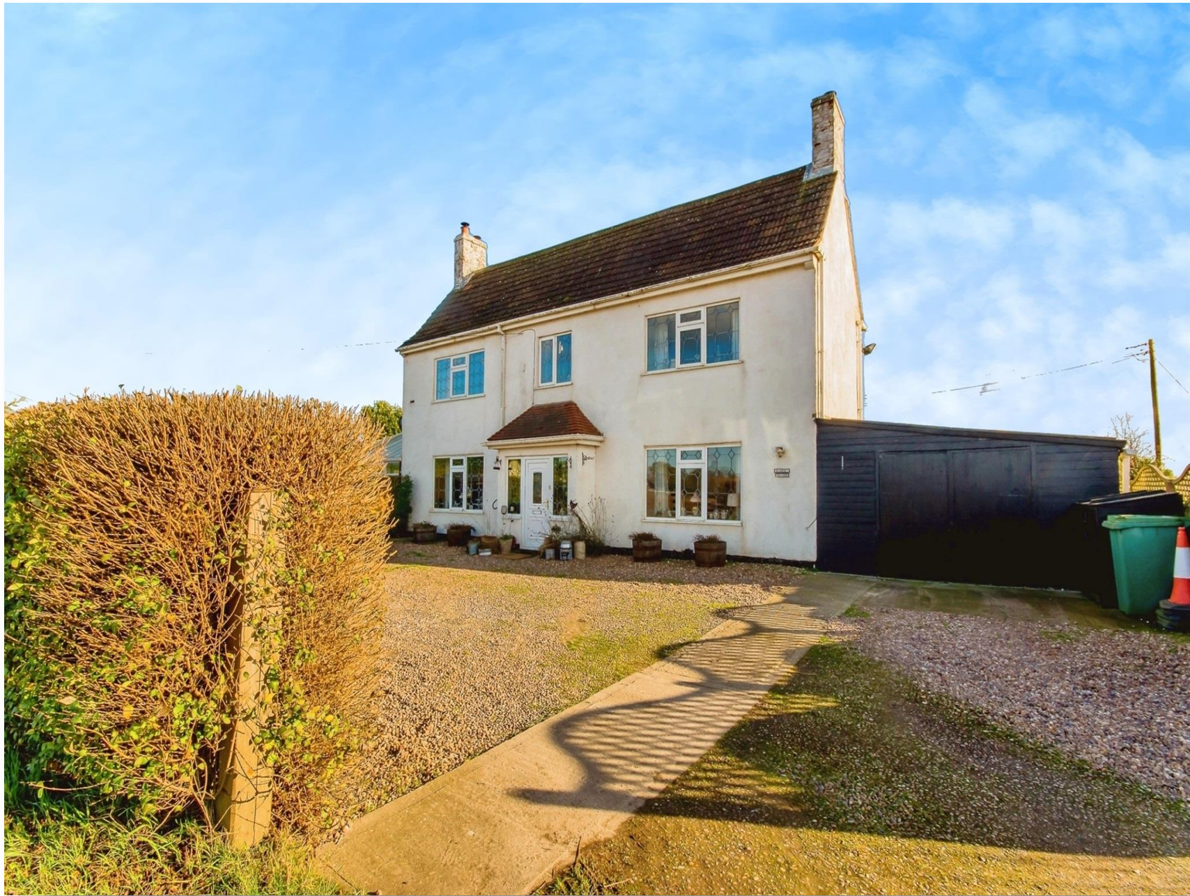
Russet House Clampgate Road, Freiston BOSTON PE22 0NU