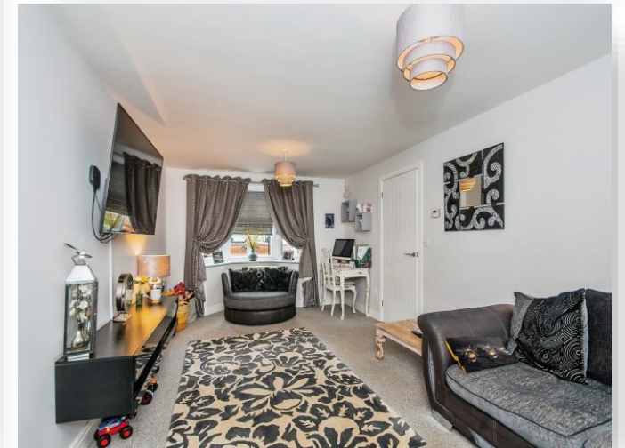
Wells Place, Wyberton Boston PE21 7NJ