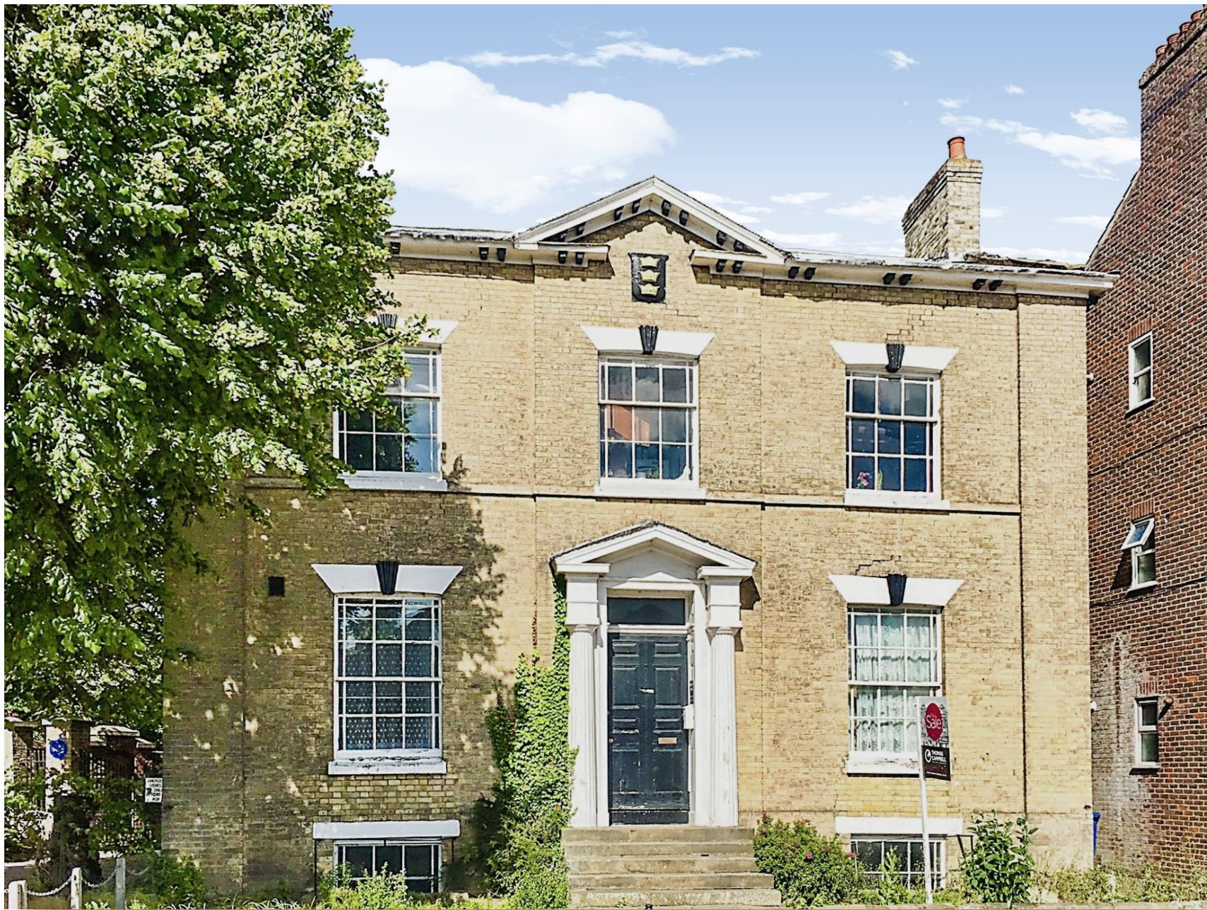
Principal House South End, Boston PE21 6JX