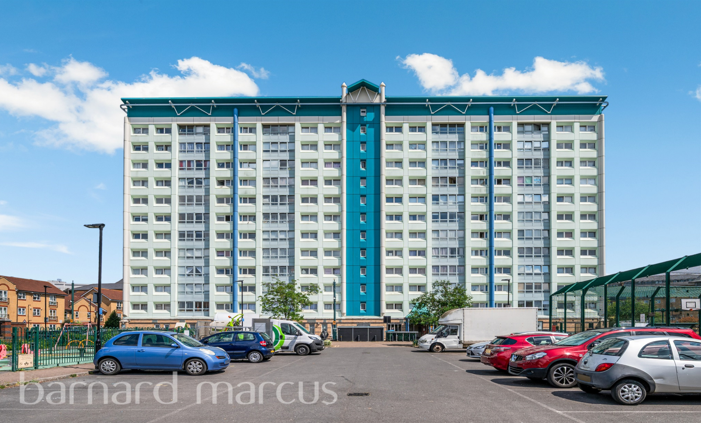
Belvedere House Lemon Grove, Feltham TW13 4DH